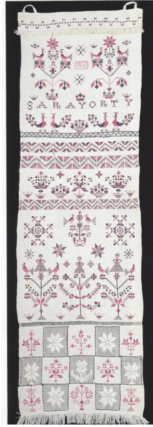
German Handtuch Ojibwe Beading